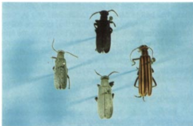
Figure 2. Black, spotted, striped, and gray blister beetles are representative of the many species in the U.S.

Blister beetles complete one generation per year. Adult beetles mate and the females lay eggs during the summer in shallow cavities in the soil. These eggs hatch in the fall and the larvae immediately begin searching for grasshopper eggs to consume. Grasshopper eggs are laid in clusters of up to 30 or more within 1 to 2 inches of the soil surface during the late summer and fall. Blister beetle larvae devour clusters of eggs, then overwinter in the soil and emerge as adults in late spring.