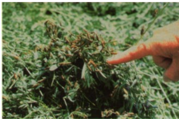
Figure 3. Typical swarm of striped blister beetles found on alfalfa hay.